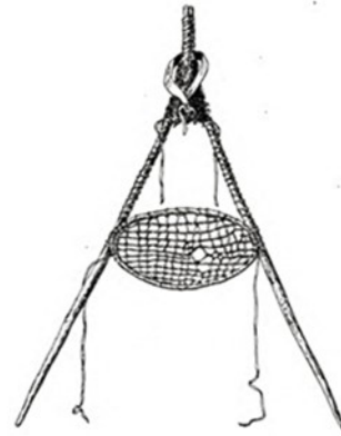
Blackfoot dog travois. Anthropological Papers of the American Museum of Natural History. Material culture of the Blackfoot Indians. 1910. Clark Wissler. p. 89