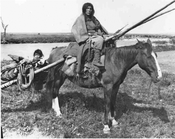
Woman and Child with Travois. (1900-1920). Cree.