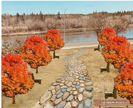
Alternate Path Type: Compressed River Pebble