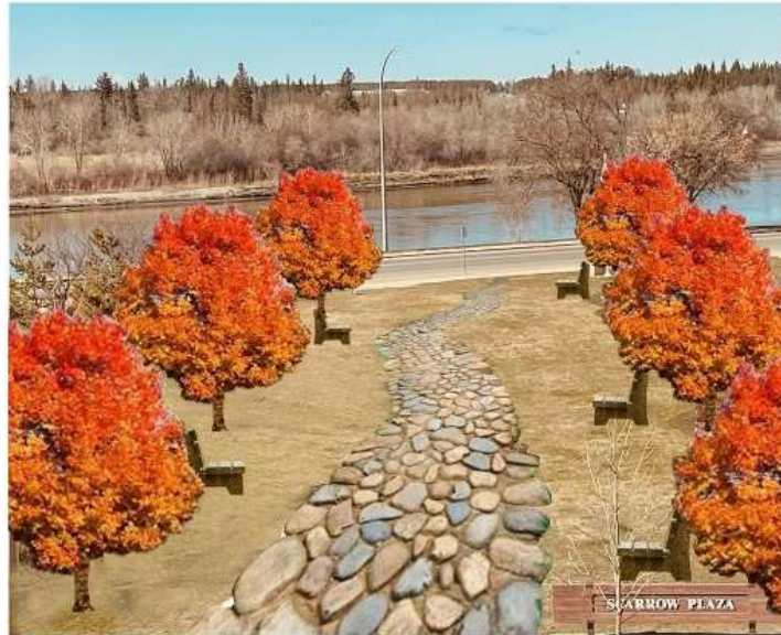
Alternate Path Type: Compressed River Pebble